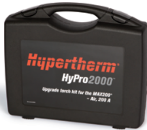
Kit part number 228908