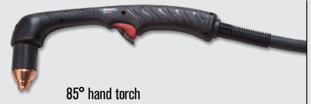
85° hand torch

Duramax Hyamp standard torch styles (for more torch options, see www.hypertherm.com )