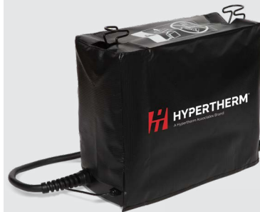
System dust covers