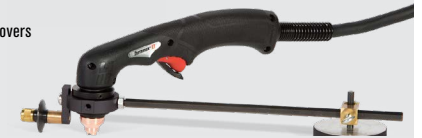
Circle cutting guides

Learn more at www.hypertherm.com/powermax30XP