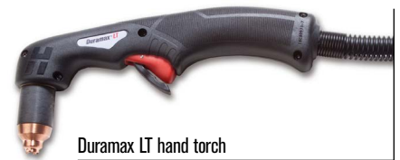
Duramax LT hand torch

(for more torch options, see www.hypertherm.com )