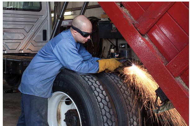
Vehicle repair and modification