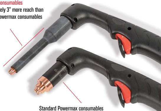
Standard Powermax consumables

Approximately 3" more reach than standard Powermax consumables