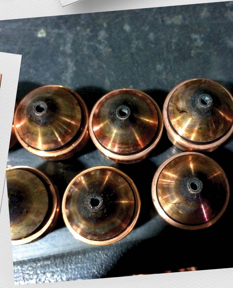
Inconsistent nozzle life

Suspect it's counterfeit? Contact us at: www.hypertherm.com/reportcounterfeit