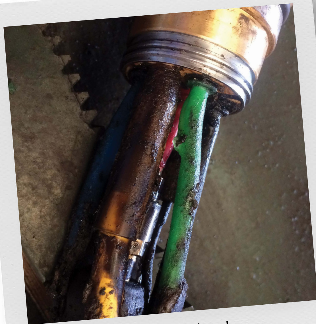
Burnt torch leads