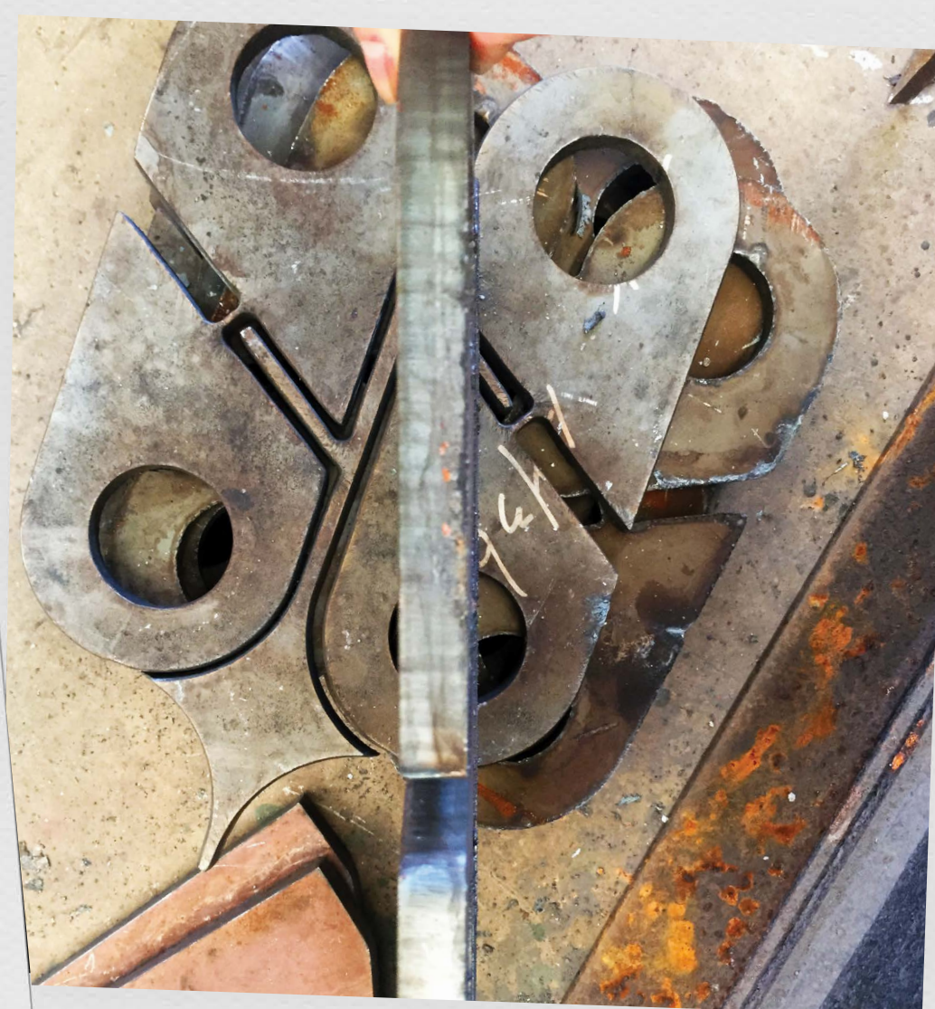
Poor quality cuts