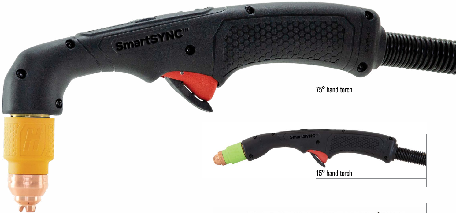
75° hand torch