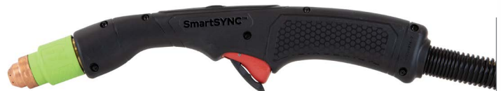
15° hand torch